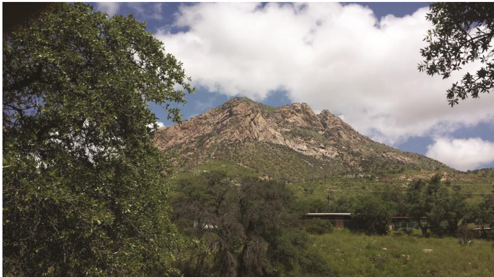
Coronado National Memorial

Discover Sierra Vista's extraordinary skies and uncommon ground. Four seasons and high elevation mean a temperate climate, great for year 'round recreation. Glorious sunsets give way to dark skies, perfect for star gazing. And, sky islands create lush near-tropical climates that welcome unparalleled diversity of plant, bird and animal life. We'll have dinner and spend the night here.