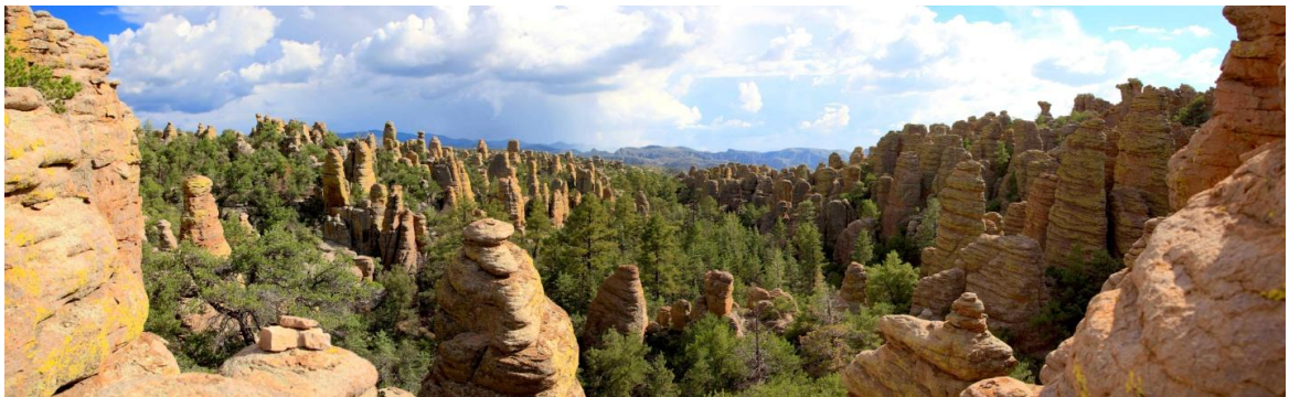
Chiricahua National Monument